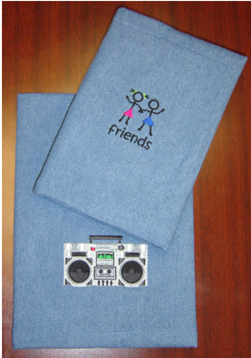
Stick Kids Friends CD071608TD Back to School Stick Kids Design Pack